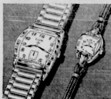
ELGIN THORNDALE $39.75 ELGIN ATTON $33.75