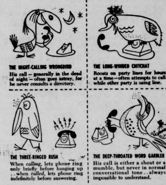
THE NIGHT-CALLING WROTHOIRD His call - generally in the dead of night - often goes astray, for he never consults a directory.

A unique collection of RARE BIRDS ... of the genus Commonus Erroneous , often observed breaking the rules of telephone courtesy. Watch for them... their calls are easily recognized.