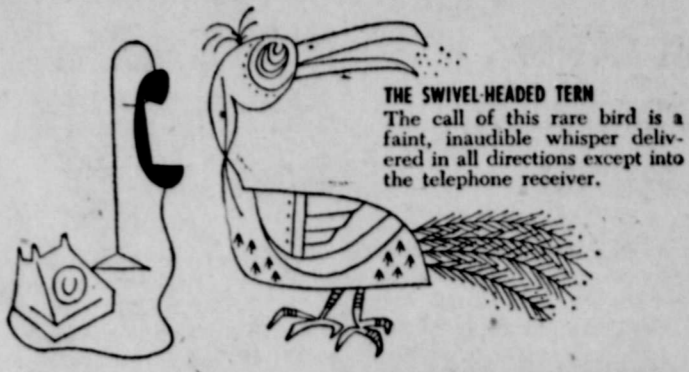
THE SWIVEL-HEADED TERN The call of this rare bird is a faint, inaudible whisper delivered in all directions except into the telephone receiver.