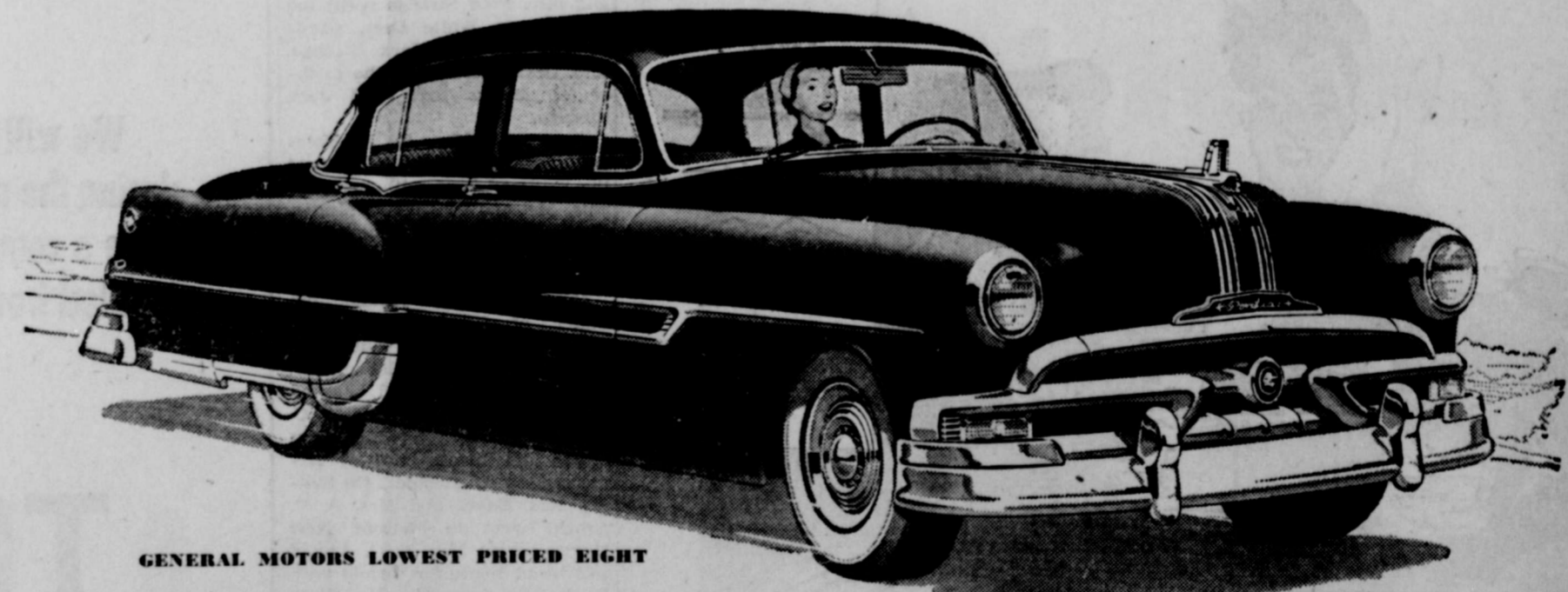
GENERAL MOTORS LOWEST PRICED EIGHT