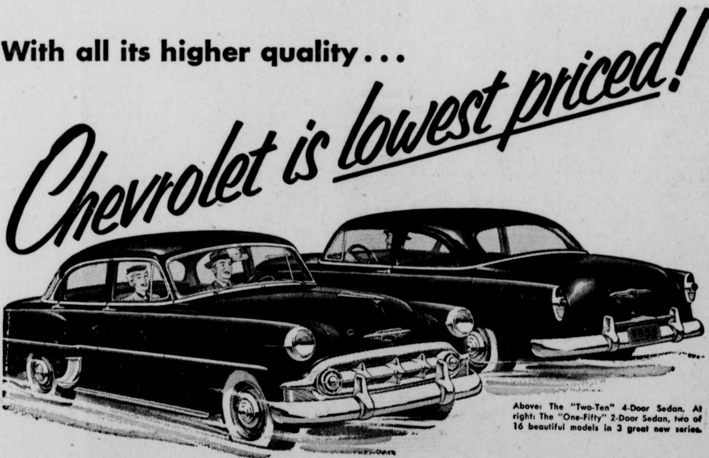
Above: The "Two-Ten" 4-Door Sedan. At right: The "One-Fifty" 2-Door Sedan, two of 16 beautiful models in 3 great new series.

It brings you more new features, more fine-car advantages, more real quality for your money . . . and it's America's lowest-priced full-size car!