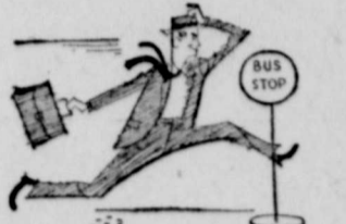
GOING INTO BUSINESS