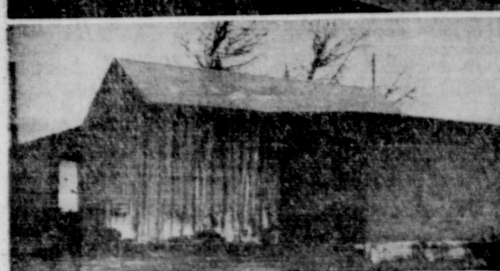
To create the new house, top, from an original homestead, the owners added new rooms, reroofed with colorful asphalt shingles and put on asbestos siding. Several new windows were added.

A major advantage of home remodeling is that improvements can be made step by step, with the pace of the work fitted to the owner's ability to pay for it. A home can continue to be lived in while gradual change takes place. A home on the range near Baker, Nev., is an example of how this is done. It also shows the extent to which modern building materials permit transforming an old house into a comfortable, upto-date dwelling.