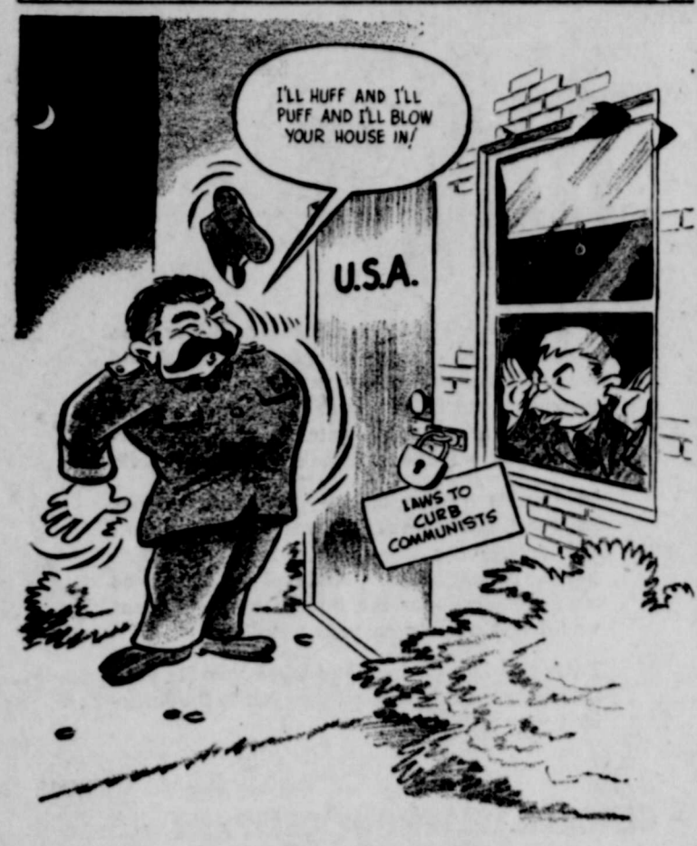
That Big, Bad Wolf