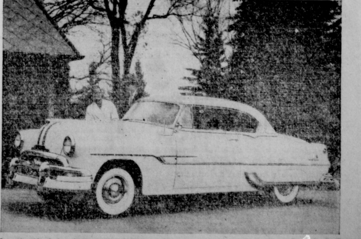
In nationwide dealer showings, Pontiac Division of General Motors today introduced its new line of Dual-Streak Chiefline models, featuring longer wheelbase, increased styling and new curve-control front suspension. Advanced styling is marked by smooth contours, rear fender fin and high deck lid, one-piece curved windshield, wrap-around one-piece rear windows, roof interiors and entirely new radiator grille and chrome treatment. Above is the new Custom Catalina, one of 11 body types in three Chiefline series: Special, De Luxe and Custom. Wheelbase for all series is 122 inches, with Power Steering as optional equipment.