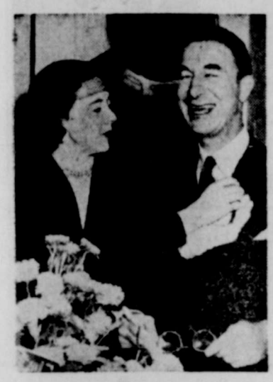
OFF TO EUROPE . . . Senator Estes Kefauver and wife Nancy rest in their stateroom aboard the S.S. United States just befor the big ship sailed from New York to Europe.