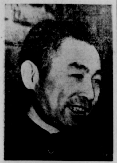
RED PREMIER . . . It was announced that the talks in Moscow between Chinese Prime Minister Chou En-lai (above) and high Russian officials were