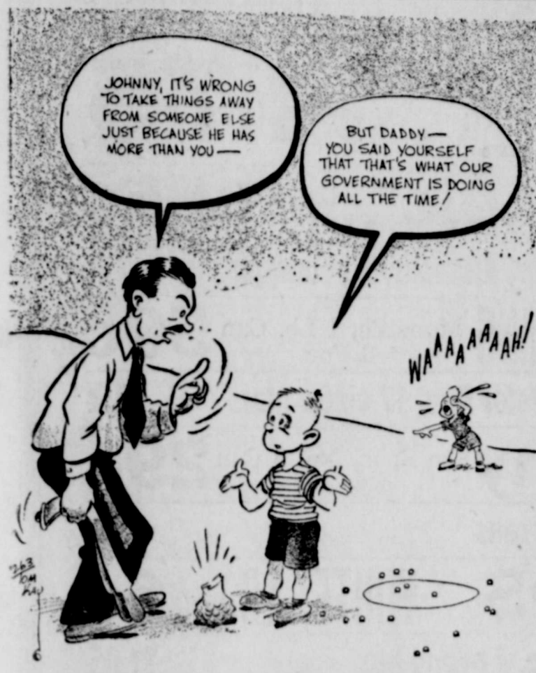
No Wonder Johnny's Puzzled