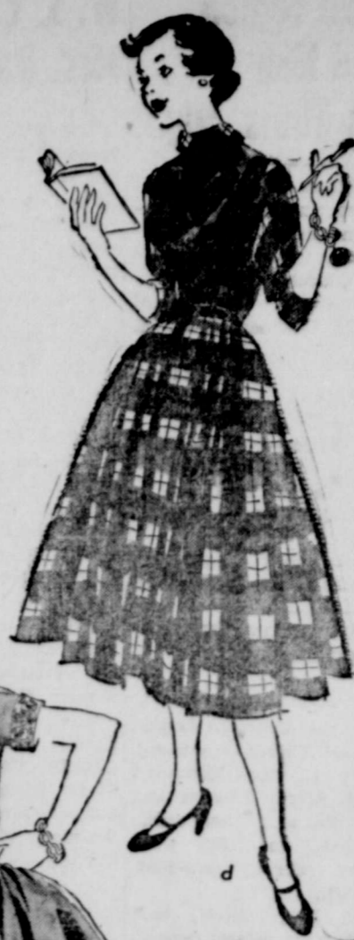
SCOTTISH LASSIE: Black velvet gives a weskit effect to this young charmer. New turtle neckline and wide box-pleated skirt complete the picture. Sizes 7-15.