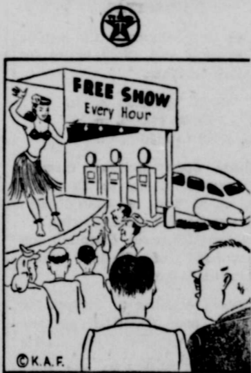
"We had to do it to meet competition."

Competition "is" keen. But, it has kept us on our toes, and our service grows better every day. Whatever your car might need—let US serve you.