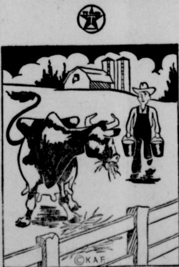
Oh, Oh - Here's ole' icy fingers.

We have the "touch" for dependable service. We're friendly folks who want to keep your good will and do everything we can to make it possible.