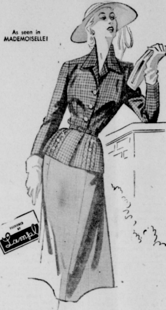
As seen in MADEMOISELLE!