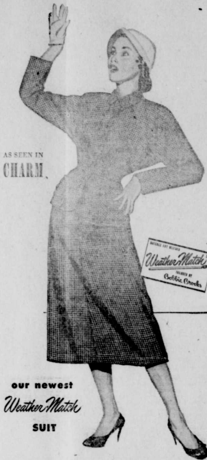
AS SEEN IN CHARM.