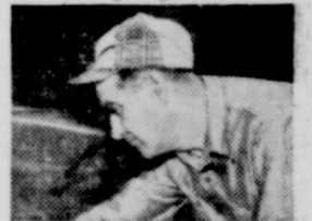
"After overhaul, Conoco Super customers drive 50,000 more miles"—R. K. Comstock, Oklahoma City.