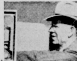
"Changed to Conoco Super, driven 29,000 miles without trouble", writes I. W. Banard, Fort Smith, Ark.