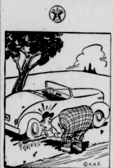
"That's the end."

There's no "end" to the quality of our products. Our GOOD gasoline, our top-quality oil, our lubrication and car washing service are designed to please YOU and protect your car.