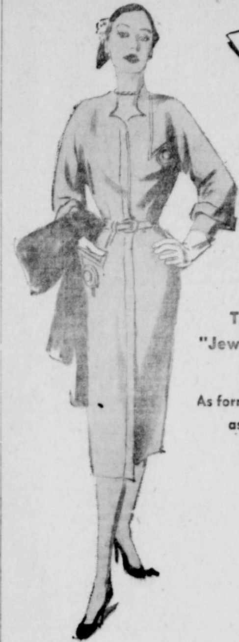
The Perez "Jewel Neckline"