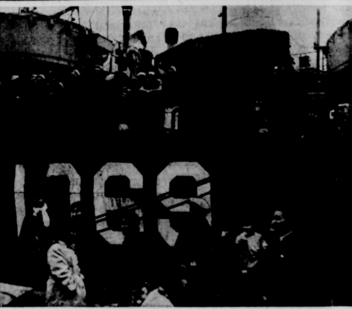
In the post-war repatriation of exiled Korean civilians and Japanese troops to their homelands, U. S. Navy LST's made seven trips to accomplish that mission of mercy. Photo shows crew members of USS LST 1069 watching Korean civilians as they prepare to board the vessel prior to the last trip.