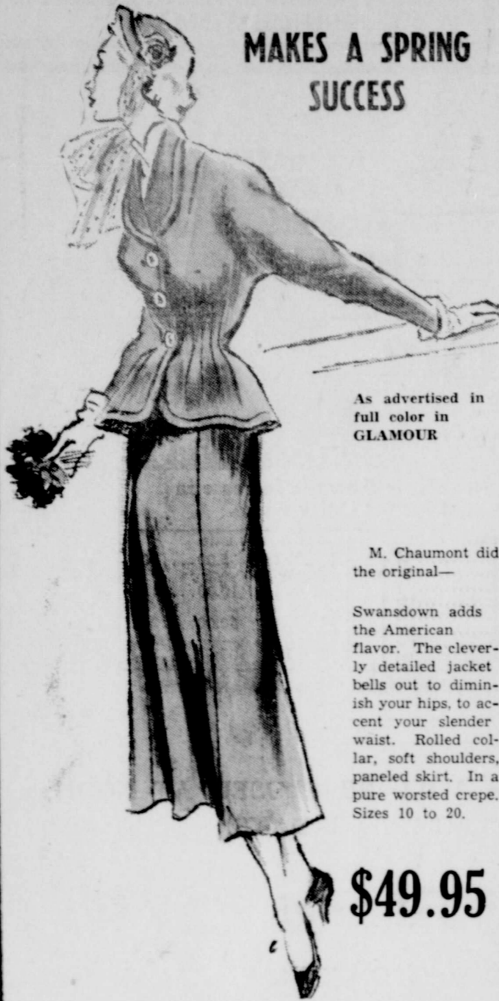
As advertised in full color in GLAMOUR