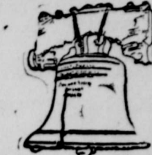
Left—Christ Church in Philadelphia has a copper roof that is over 200 years old. Above—Drawing of the bronze Liberty Bell. Below—Convention crowd outside Municipal Auditorium in Philadelphia, Pennsylvania.

Philadelphia — the cradle of American Liberty — is where the first Continental Congress met in 1774, where the Declaration of Independence was written and proclaimed in 1776, where the Federal Constitution was framed in 1787 and where George Washington was elected the first President of the United States in 1789. Philadelphia was also the first capital of the nation.