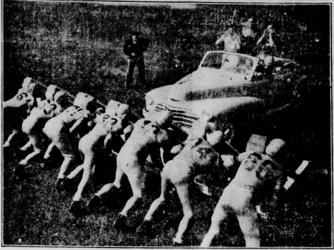
the forward wall inspiration. The mechanized practice sess of the Wayne University football team of Detroit works out in novel fashion at the blocking sled, providing the perspiration, while four attractive Tartar fans offer workout, but said they'd never faced prettier competition.