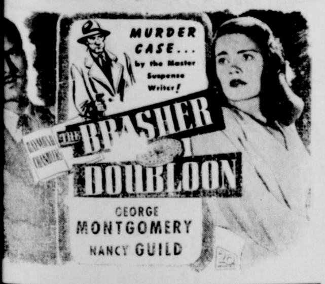
Thursday and Friday