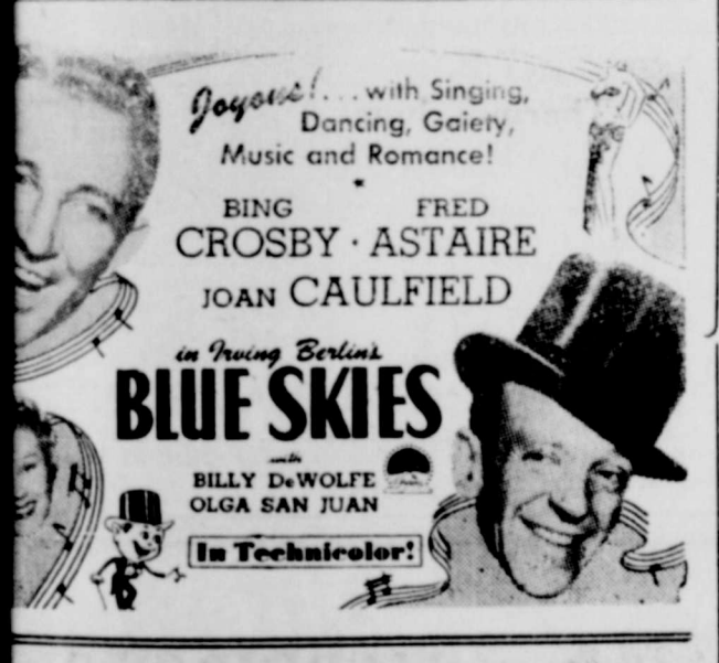
Tuesday and Wednesday