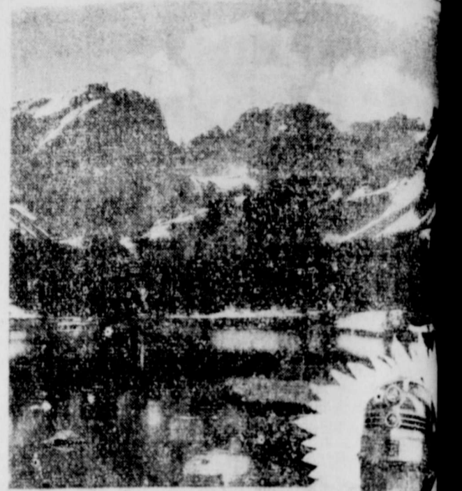
All vacation trails lead to and thru Colorado