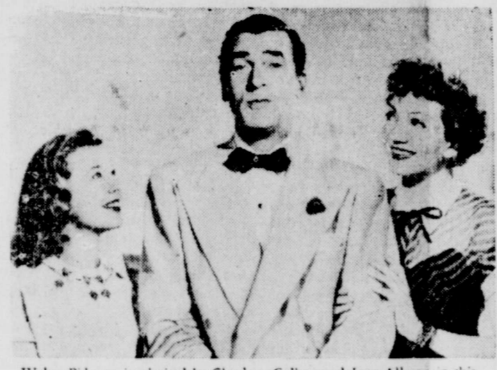
Walter Pidgeon is admired by Claudette Colbert and June Allyson in this scene from "The Secret Heart," with Lionel Barrymore and Robert Sterling.