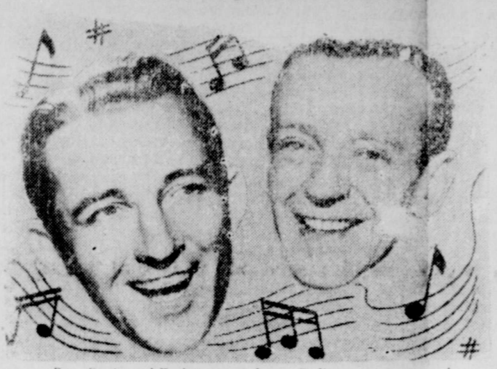
Bing Crosby and Fred Astaire in Irving Berlin's romantic musical, "Blue Skies," with Joan Caulfield.