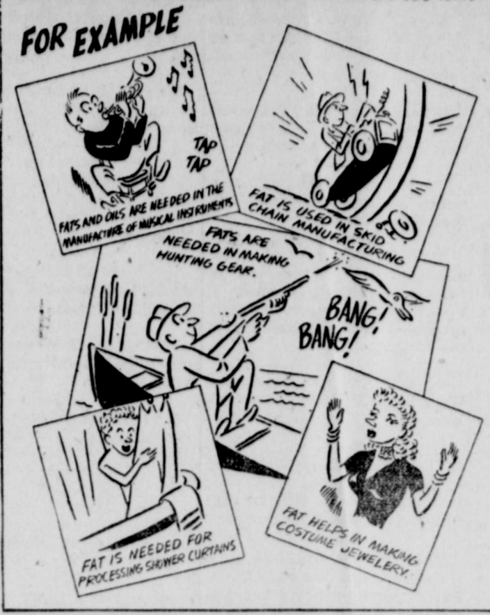
You saved used cooking fet for war needs, - continue saving it to help yourself and your family regain the peacetime plenty of America.

PEACETIME MANUFACTURING NEEDS USED FATS! CONTINUE SAVING EVERY DROP TO HELP SPEED UP PRODUCTION OF PACKAGE AND LAUNDRY SOAP AND OTHER THINGS YOU WANT-