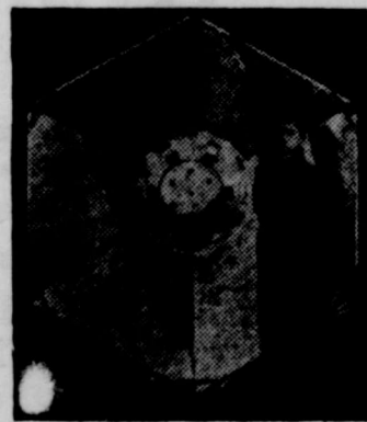
America's Finest Brooder

The Best, Most Economical, Most Efficient, and Biggest-selling Brooder in the U. S. A?