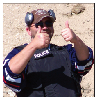
Duff's reaction to "full-auto"

The Food Network's star baker and members of his Charm City Cakes bakery staff were