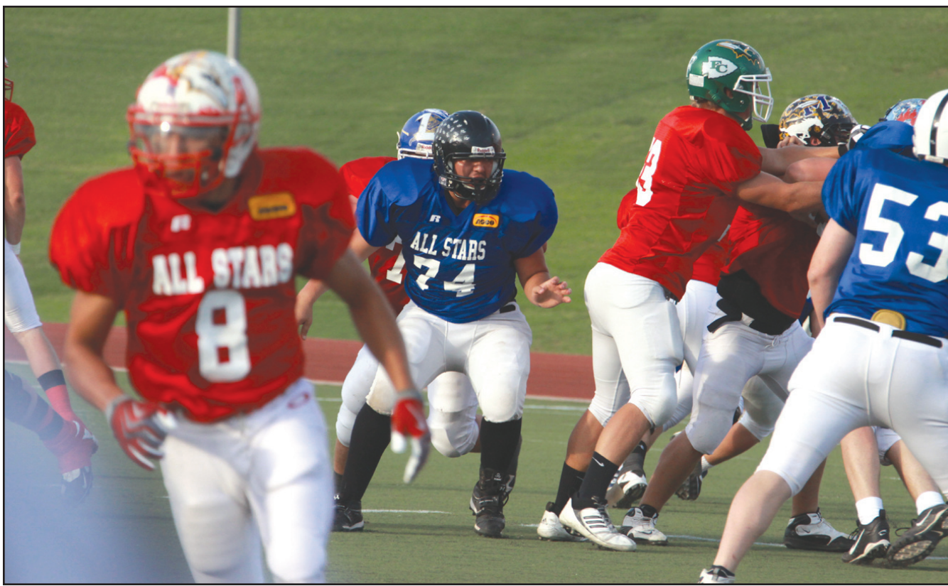
Photograph by James King