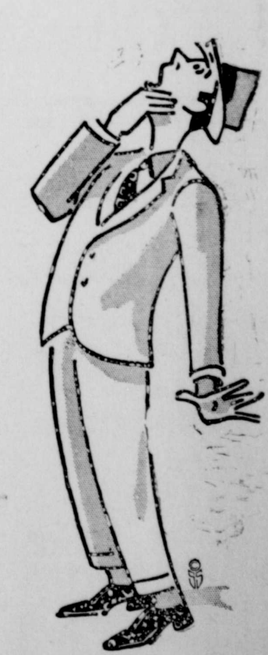
"Well I guess I better get up ther and renew before the ornery cus stops my paper!"