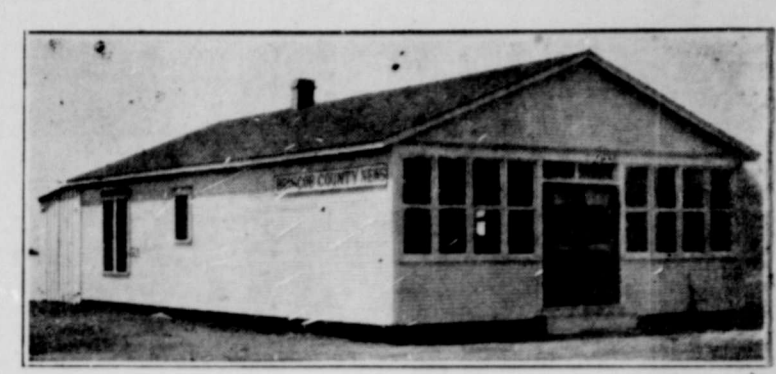
She looks tough but she won't fall in on you. Come on in!