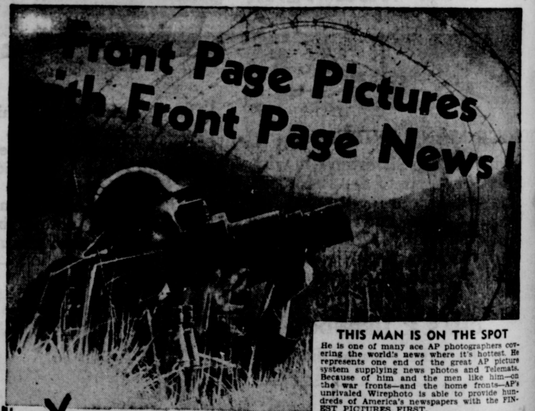
THIS MAN IS ON THE SPOT He is one of many ace AP photographers covering the world's news where it's hottest. He represents one end of the great AP picture system supplying news photos and telecasts. Because of him and the men like him—on the war fronts—and the home fronts—AP's unrivaled Wirephoto is able to provide hundreds of America's newspapers with the FINEST PICTURES FIRST.