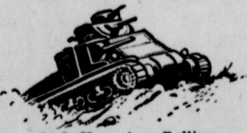
And, Keep 'em Rolling