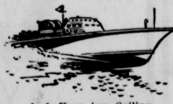
And, Keep 'em Sailing