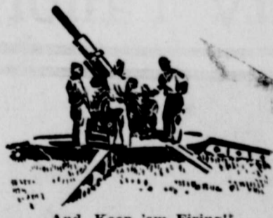
And, Keep 'em Firing!!