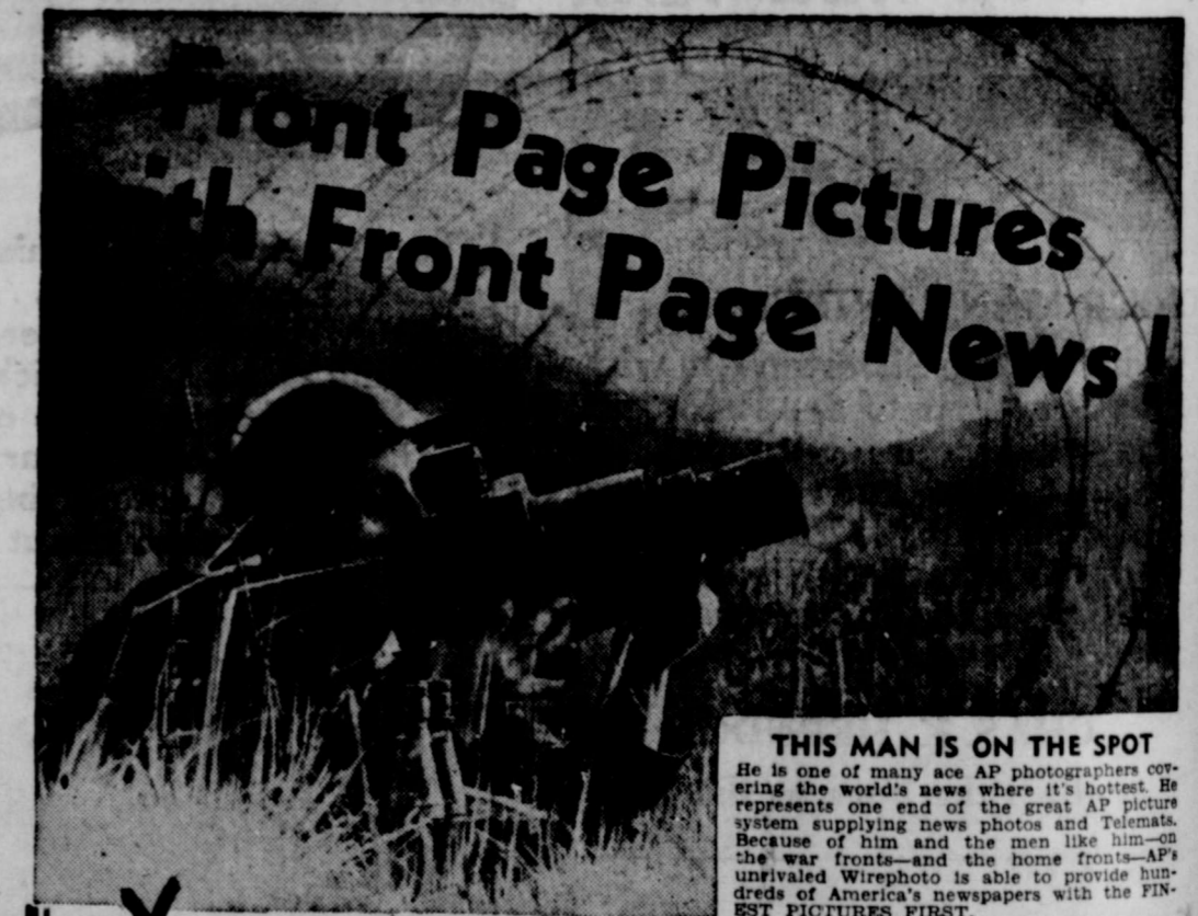
THIS MAN IS ON THE SPOT He is one of many ace AP photographers covering the world's news where it's hottest. He represents one end of the great AP picture system supplying news photos and telecasts. Because of him and the men like him—on the war fronts—and the home fronts—AP's unrivaled Wirephoto is able to provide hundreds of America's newspapers with the BEST PICTURES FIRST.