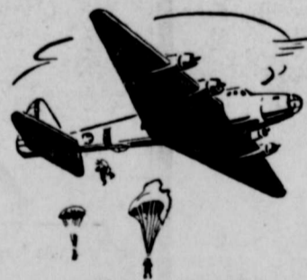
And, Keep 'em Flying