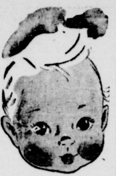
"I'll vote for electric cookery"