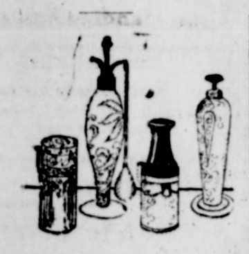
Toilet Requisites for That Par-