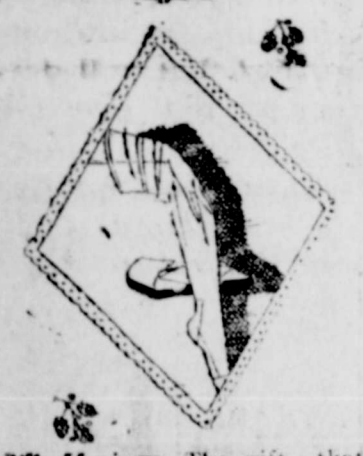
Silk Hosiery: The gift that' Sure to Please.