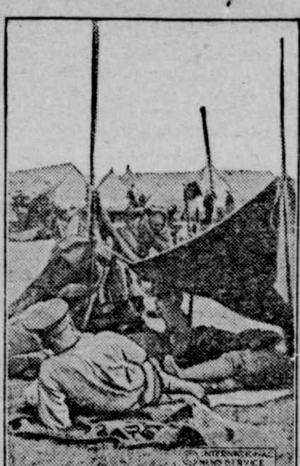
Resting Back of the Lines.

After breakfast our section carried their equipment into a field adjoining the billet and got busy removing the trench mud therefrom, because at 8:45 a. m., they had to fall in for taspection