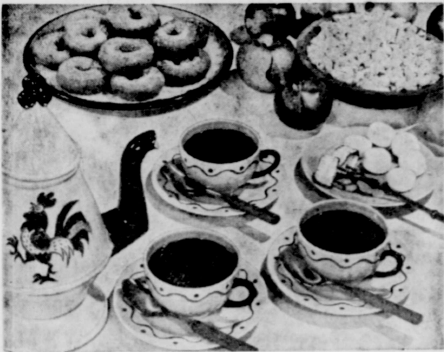
Simple Fireside Party Eases Budgets (See Recipes Below)