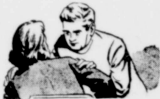
May childbirth un hinge a woman's reason?

Answer: It's not easy. One main reason why so many people do not marry—and why those who do can't "let go" enough to enjoy and truly love each other—is fear of the power to hurt your feelings which loving another person gives him. But remember that what makes this kind of hurt so terrifying is a childish sense of helplessness—it's a relic of the time when you felt unsure of your parents' love because you could do nothing to deserve it. Realize that as an adult you're worth loving, and you'll be less vulnerable.