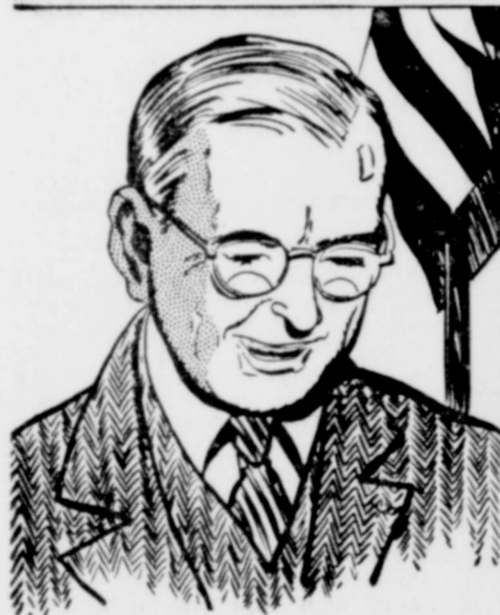
PRESIDENT TRUMAN IS UNUSUALLY WELL LEARNED IN BIBLE KNOWLEDGE. HE CAN QUOTE MANY OF THE PASSAGES TO DRIVE HOME A POINT HE IS TRYING TO MAKE.