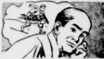
Has everyone a "neurotic conflict"?

to mean is something to be ashamed of) may be driven to mental illness when she faces the experience herself, especially if her labor is a difficult one. If you fear approaching motherhood unduly, go to a psychiatrist and get your childish fears "out of your system."