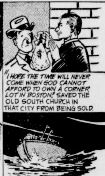
"I HOPE THE TIME WILL NEVER COME WHEN GOD CANNOT AFFORD TO OWN A CORNER LOT IN BOSTON!" SAVED THE OLD SOUTH CHURCH IN THAT CITY FROM BEING SOLD.