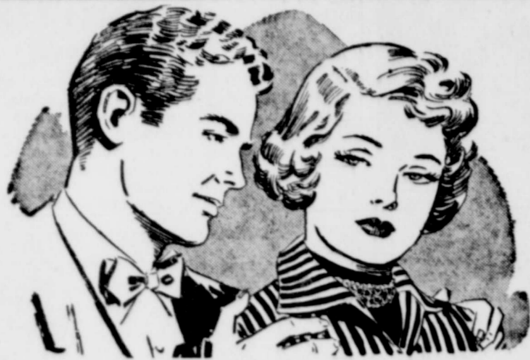
Can the fear of being "hurt" be overcome?

Overcome Fear Of Being Hurt By Lawrence Gould