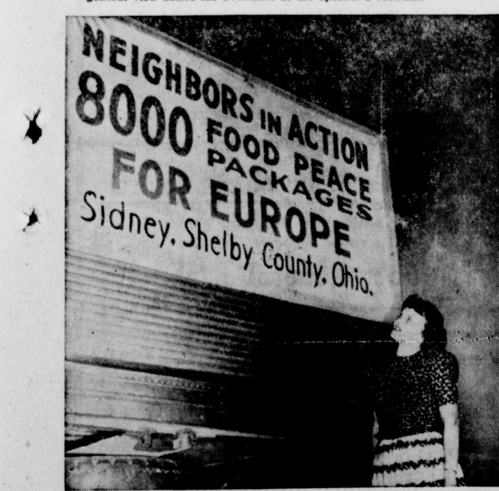
SMALL TOWN PEACE MOVEMENT . . . As high government officials and foreign diplomats falter in their quest for world-wide peace, residents of Shelby county, Ohio, demonstrate that small peoples everywhere can play a significant role in the movement. Through their peace movement, known as "Neighbors in Action," Shelby county residents hope to promote peace by sending food and goodwill overseas.