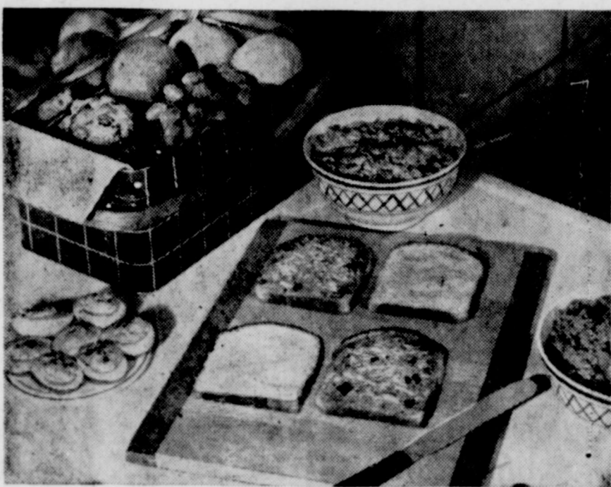
These Foods Make a Picnic (See recipes below)