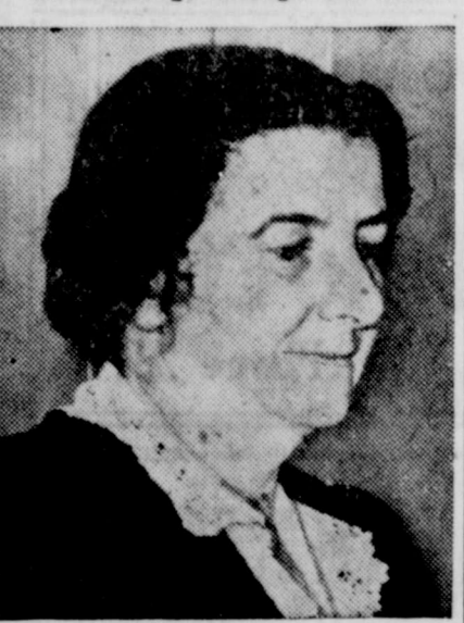
WOMAN DIPLOMAT . . Golda Myerson is Israel's first minister to Russia. Now a member of Israel's council of state, she was born in Russia and lived in the U. S. since she was seven.