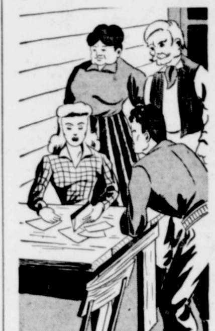
They watched intently as Sue picked up the packet and spread its contents on the table.

Sue frowned uncertainly. "It sounds reasonable," she said at length—"provided the papers do not have anything to do with Barlow or his gang. If they do we'll keep them as evidence." Her voice took on an edge of bitterness as she added, "I