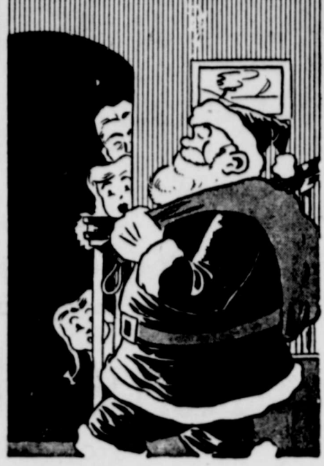
"Santa was just coming out."

"We can?" she sat up in surprise. "Sure. You go to bed just like always, then when he comes I'll wake you up."