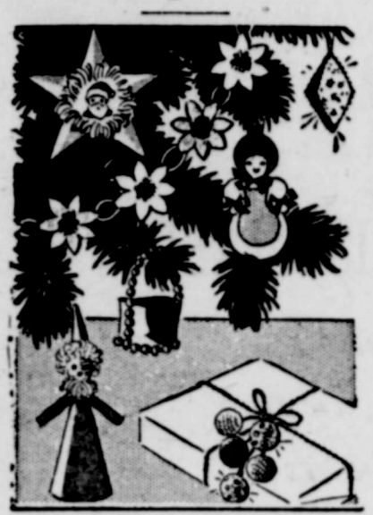
Pattern No. 5642

HERE are some colorful Christmas tree ornaments that the children will have fun making. The cute angel on the tree top wears developments from the city, which provided it from areas taken over for taxes and declared "blighted." Rochester has no per-