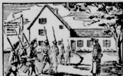
Revolutionary troops heading for Marlborough Tavern for final muster.

The marks were made there by a Marlborough company of Continental troops, who, following demobilization orders on October 18, 1783, marched into the tavern taproom for their final muster and discharge. They smartly stacked their guns with an upward flourish that drove the bayonet points into the ceiling, making a tally mark of the company roster that has endured to this day.