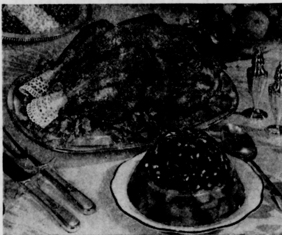
Relish Adds Zest to Roast Turkey (See Recipe Below)