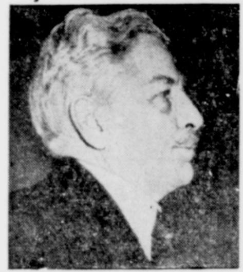
Maj. Gen. Patrick Hurley

Regarding U. S., British, Dutch and Canadian pre-Pearl Harbor discussions, Marshall said their purpose primarily concerned the defeat of Germany rather than Japan. In a message to President Roosevelt sometime in the summer of 1941, the former chief of staff opined that the Allies could not defeat the Nazis with supplies alone, but large ground forces would be required.