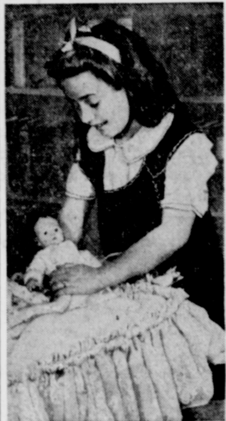
Dolls a big favorite.

There will be only a token showing of wheel toys, electric trains and mechanical toys of metal, a survey of toyland supplies in-