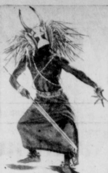
AUTHENTIC witch doctor is seen in "Africa Adventure," weekend feature at Ocotillo theater.

FREE! Our work is guaranteed on Radios and TV's. Give us a call at SH 6-3431 for day or night service.