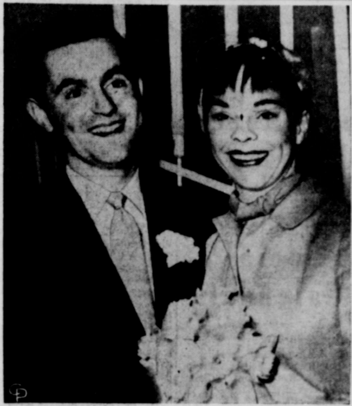
CAROL HANEY, 29, star of Broadway hit "Pajama Game," and Larry Blyden, 31, in play "Oh Men, Oh Women" in San Francisco, shown at wedding in Las Vegas, Nev.