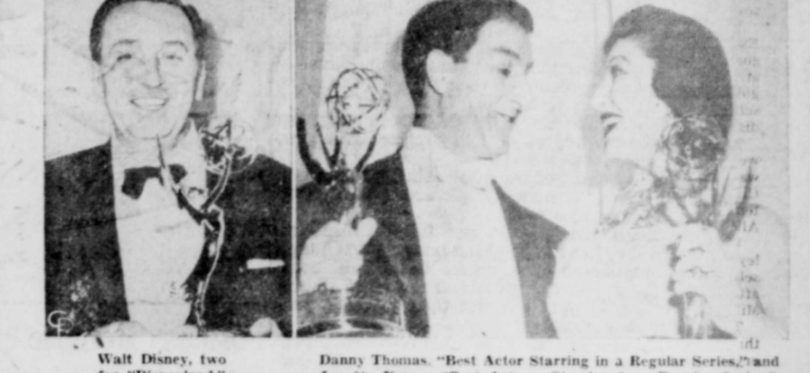
Walt Disney, two for "Disneyland." Danny Thomas, "Best Actor Starring in a Regular Series," and Loretta Young, "Best Actress Starring in a Regular Series."