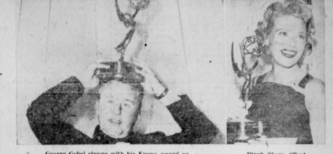
George Gobel clowns with his Emmy award as "Most Outstanding New Personality in 1954." Dinah Shore, "Best Female Singer."