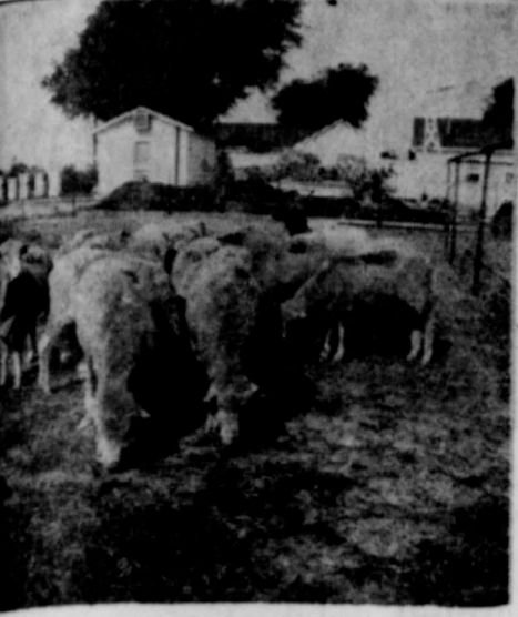
RMING program built by Mark oup includes Sears-Roebuck flock