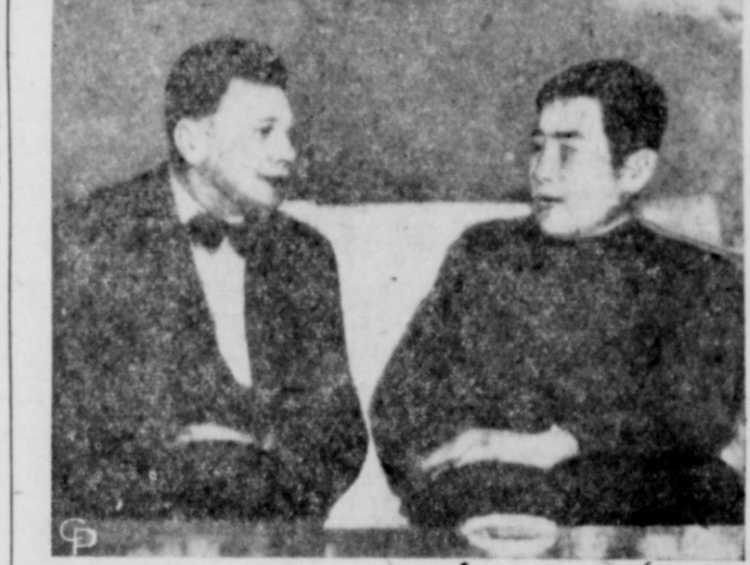
UN SECRETARY GENERAL Dag Hammarskjold (left) and Communist China's Premier Chou En-lai are shown conferring in Peiping over the 11 U.S. flyers sentenced as spies.