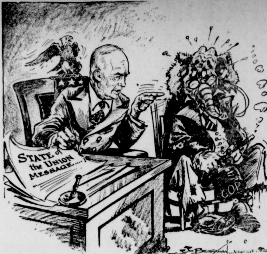
Distributed by King Features Syndicate