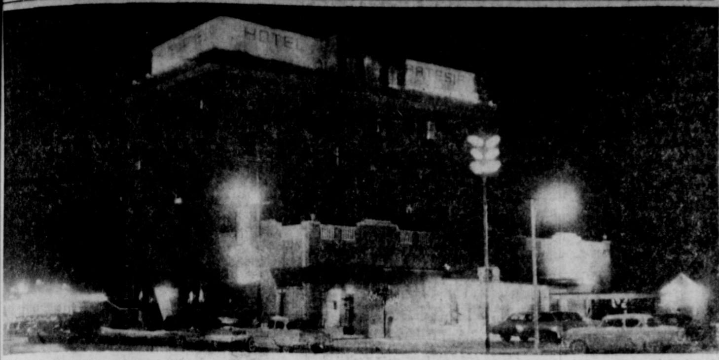
Practically new hotel inside and out—the Feldmans have made a circle drive in front of the hotel, add from a distance, and remodeled portions of the outside the Flamingo room was also made.