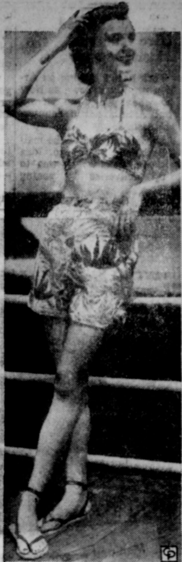
PRINTED TERRY CLOTH—Is budget-priced for vacation. Shorts and bra, by a New York designer, in leaf pattern of brown, white and turquoise is on a white background.