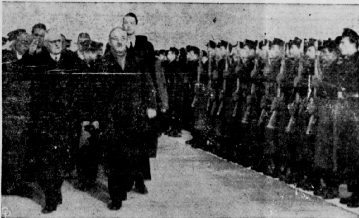
EN ROUTE TO MOSCOW following U.N. sessions in New York, Soviet Foreign Minister Andrei Vishinsky (left) inspects East Zone police at Schoenefeld Airfield, southeast of Berlin. Beside Vishinsky is Otto Nuschke, Deputy Premier of the East Zone Republic. The Foreign Minister is reported to have recently authorized the creation of a Russian-equipped East German police army numbering 400,000.

approved and shall be accompanied by supporting affidavits and by proof that a copy of the protest has been served upon the applicant. Said protest and proof of service must be filed with the State Engineer within ten (10) days after the date of the last publication of this notice. Unless protested the application will be taken up for consideration by the State Engineer on that date, being on or about the 23rd day of January, 1950. JOHN H. BLISS, State Engineer. 64-31-T-1