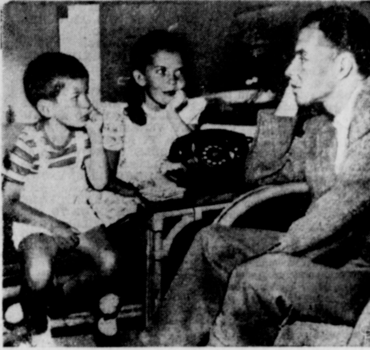
WAITING FOR SIR STORK to broadcast news that a baby girl had been added to his family, singer Frank Sinatra sits anxiously beside the phone in his Hollywood home with Franklin, 4, and Nancy, 7. The baby weighed 8 pounds, 14 ounces and was named Christina.