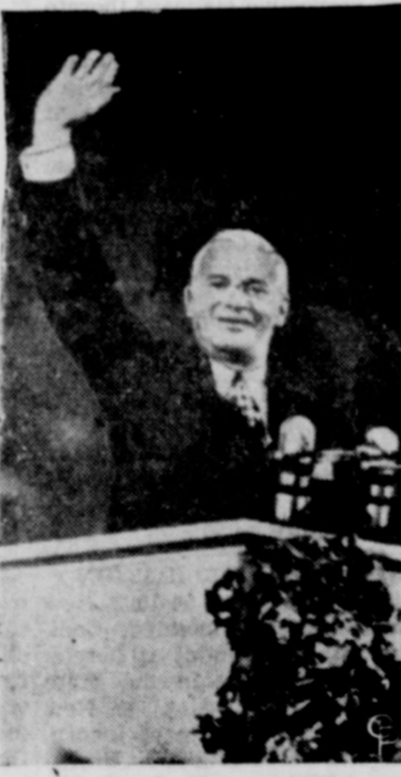
GOVERNOR Dwight H. Green of Illinois is shown as he was about to deliver the keynote address at the National Republican Convention in Philadelphia. On the first ballot, Illinois' 56 votes will go to the state's favorite son, Governor Green.