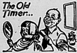
"School days are the happiest days of a person's life—if she's a mother!"