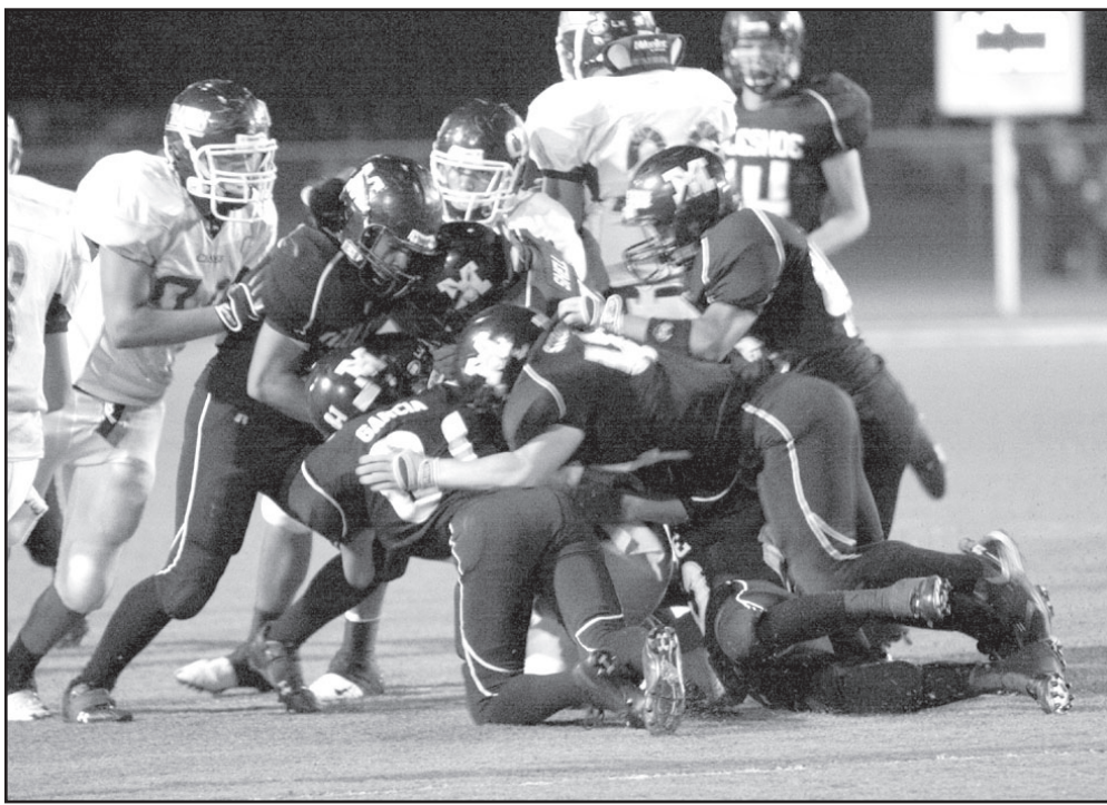
The Mule defense at work during Friday's winning game.