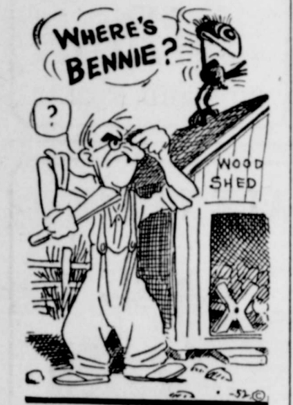
He's taken a runout powder to the . . .

in storage at central points in the state and will be available for use where needed next spring.