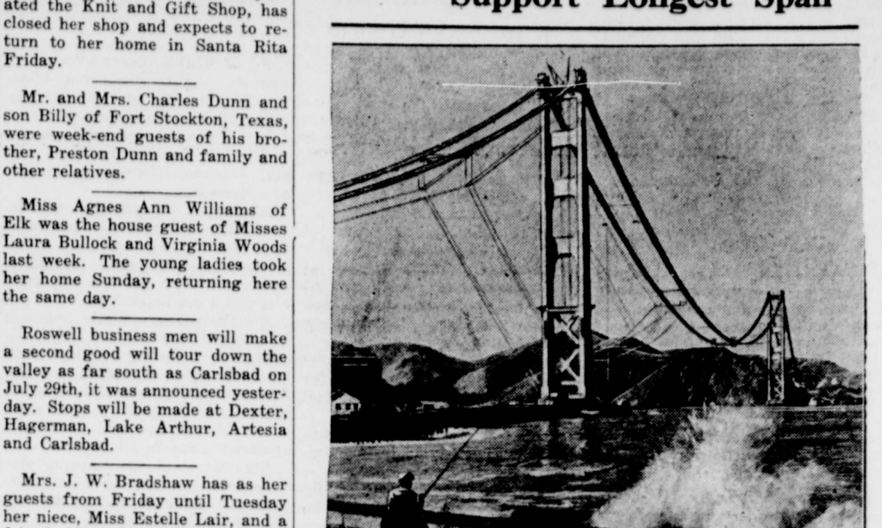
wo 746 Feet High Towers of Largest Suspension Bridge in World Are 4200 Feet Apart.

JORK on the main span of the | pleted in the spring of 1937, the Golden Gate Bridge, the larg- towers and main span will have est suspension bridge in the world, will soon be started by the Bethlehem Steel Company which re- 100,000 tons. cently completed erection of the two great towers for the bridge. The the same as that of a sixty-five towers are 4200 feet apart as com- story building, and a large oceanpared with the 3500 feet distance going steamboat will have more between towers of the George than 200 feet clearance when pass-Washington Bridge across the Hud-son River between New York City The bridge will have a six-lane