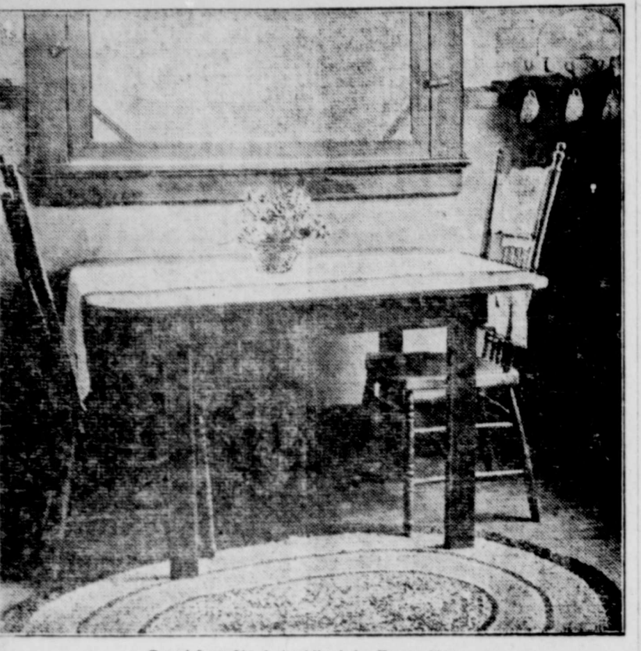
Breakfast Nook in Virginia Farm Home

(Prepared by the United States Department of Agriculture.) In many modern houses a space is especially set apart, either in a corner of the kitchen or between the kitchen and dining room, for what has come to be known as a "breakfast alcove." The fashion has been to have a painted stationary table in this alcove, and built-in benches or seats to match. When painted in gay colors these little alcoves are cheerful and attractive, and as they are so close to the source of supplies and so easily kept clean they save the housewife considerable labor.