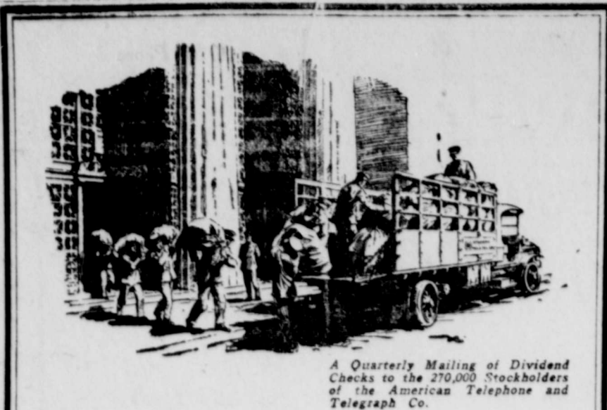
A Quarterly Mailing of Dividend Checks to the 270,000 Stockholders of the American Telephone and Telegraph Co.