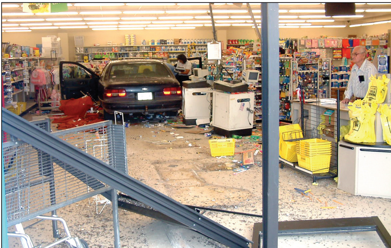
Bailey County EMS talks with the passenger in the vehicle that crashed into the Dollar General Store.