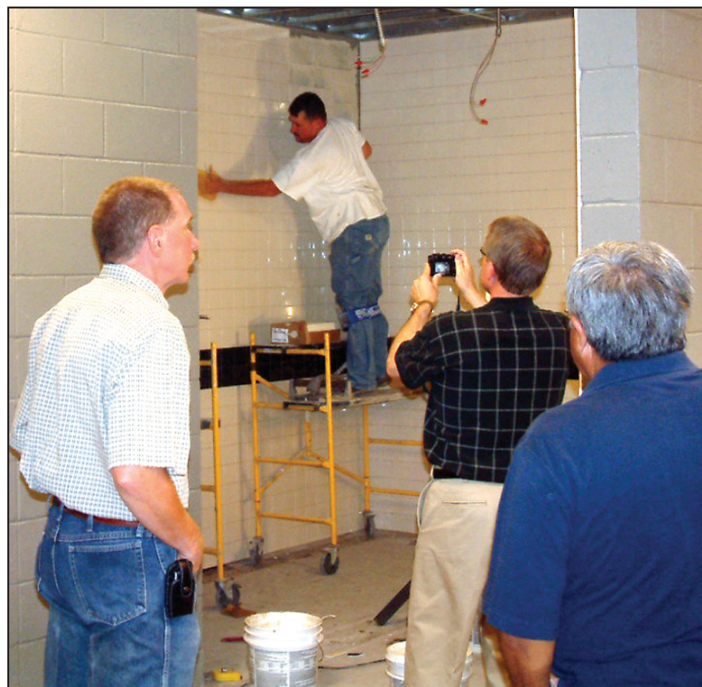
MISD board members, administration toured the high school's expansion site during Monday's board meeting. Pictured above, they watch as one of the new gymnasium's showers is being tiled.