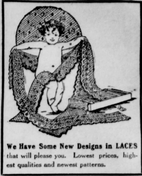
We Have Some New Designs in LACES that will please you. Lowest prices, highest qualities and newest patterns.

QUALITY and VALUES are Our Talking Points