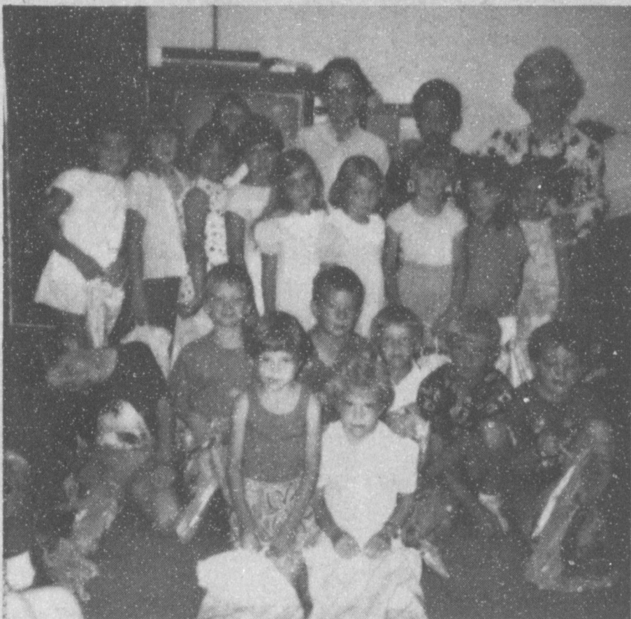
RECOGNITION DAY HELD---Twenty of the 25 top readers in the Summer Reading Club at Muleshoe Public Library were on hand Thursday morning to receive their prizes, certificates, seals, ribbons and pins. These twenty boys and girls read a total of 1,485 books.

Our advice: take care of your heart, and live a while.