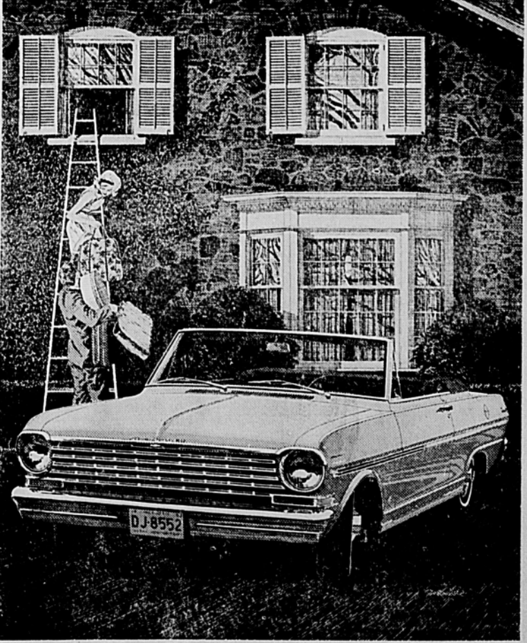
Chevy II Nova 400 SS Convertible above. Also available as SS Coupe. Super Sport equipment optional at extra cost. Also a choice of 10 regular Chevy II models.

All this plus Chevy II standard features: flush-and-dry ventilating system that helps remove rust-causing elements from rocker panels; battery-easing Delco-tron generator; convenient self-adjusting brakes; longer lasting exhaust system; styling fresh as morning coffee, poured into a rugged Body by Fisher—and more. You'll find two can live as cheaply as one—when they're living it up in a new Chevy II! *Optional at extra cost.